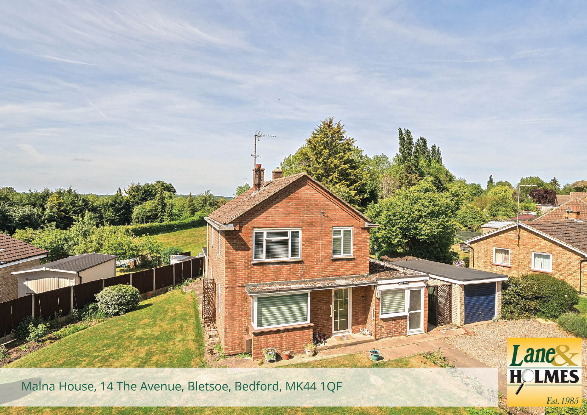
Malna House, 14 The Avenue, Bletsoe, Bedford, MK44 1QF